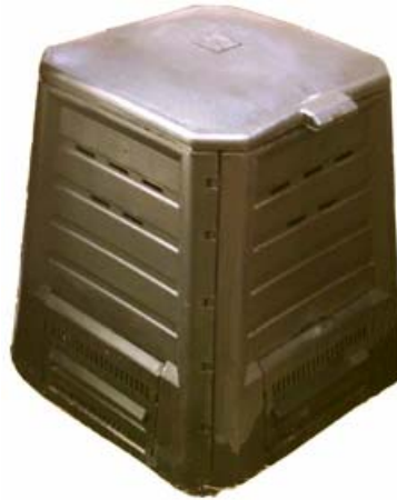
Figure 7. Composting bin in the municipality of Elefsina

funded from the Municipality of Elefsina, the Greek Ministry for the Environment Physical Planning and Public Works and the Ecological Recycling Society. The program is expected to be continued after the completion of the project because of the volunteer's high participation and the first successful implementation [14].